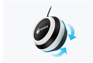
UX2 protective cap

Thanks to the USB connection, the UX2 sensor can easily be connected to the monitor with a single USB cable.