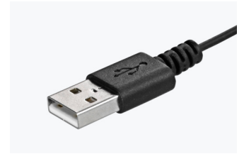
UX2 USB connection